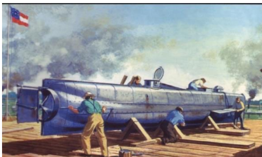
H. L. HUNLEY

Another willing crew was assembled and the Hunley went back into the water. On February 17, 1864, the ship headed out of Charleston Harbor and approached the U.S.S. Housatonic. The Hunley struck a torpedo into the Yankee ship and then backed away before the explosion. The Housatonic sank in shallow water, and the Hunley became the first submarine to sink a ship in battle. However, its first successful mission was also its last—the Hunley sank before it returned to Charleston, taking yet another crew down with it. The vessel was raised in 2000, and is now on exhibit in Charleston.